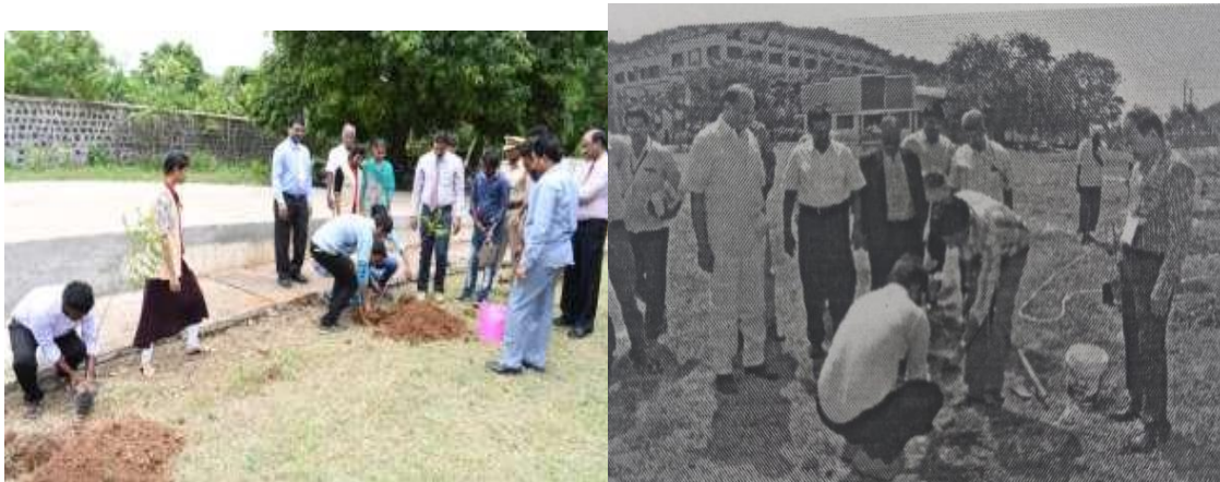
(Faculty, volunteers, B. Tech students, Chalapathi Institute of Technology)