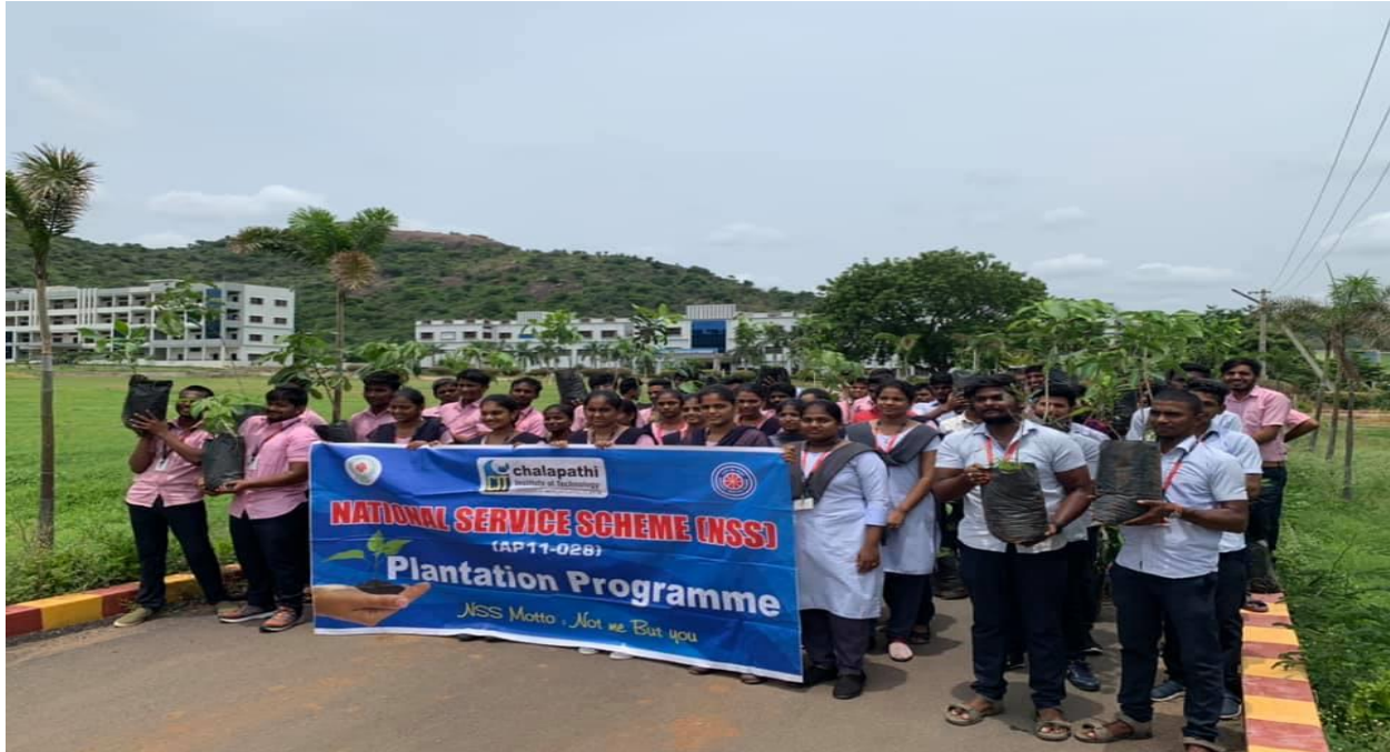
(volunteers, B. Tech students, Chalapathi Institute of Technology)