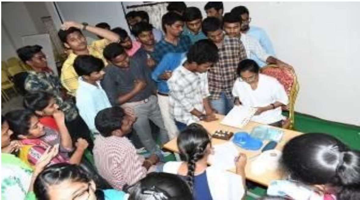
(students knowing the blood group name)