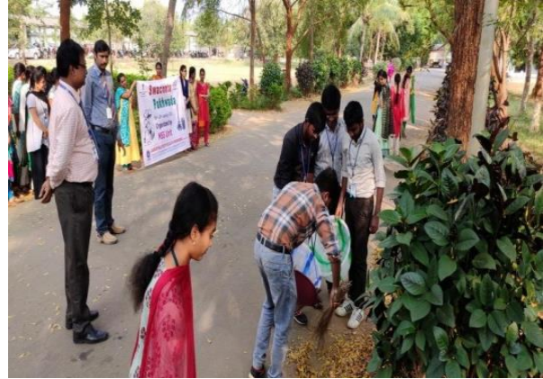
(volunteers cleaning the roads)