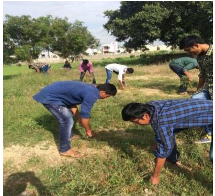
(volunteers cleaning the roads)