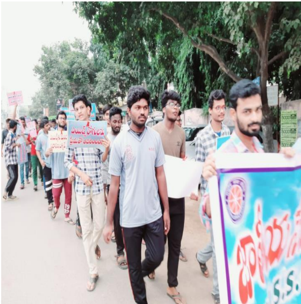
(students participating in the rally)